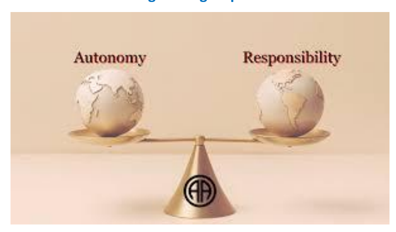
H&I - Region 15 (Shasta, Tehama & Trinity Counties)