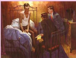
Northern California Hospital and Institution Committee Carrying the message of A.A. to the alcoholic in Corrections and Treatment facilities and facilities serving alcoholics in Northern CA

Northern California (NorCal) Intergroup is a service board of alcoholics serving groups in Shasta, Tehama, Siskiyou and Trinity Counties. Intergroup provides alcoholics with services that individual groups can't provide. Intergroup maintains a website and a 24/7 telephone service. It also answers 12-step calls, provides meeting information and maintains the schedule for the area. Intergroup is supported through voluntary contributions and its primary purpose is to carry the A.A. message to alcoholics who still suffer.